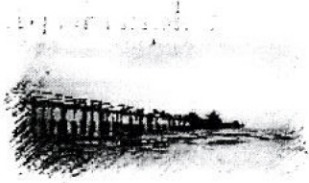
EXHIBIT A SCOPE OF SERVICES